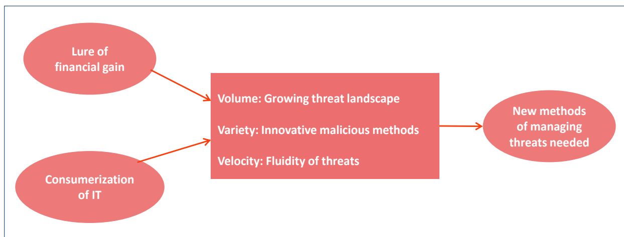
Figure 1. The growing volume, variety, and velocity of data requires new methods of managing threats

Determining whether a particular Web site or page contains malicious content is fluid over time as well. Cybercriminals routinely transform legitimate sites into corrupt sites almost instantly. In one example of many such transformations, in early 2012, cybercriminals installed an iFrame redirection on a popular news site in the Netherlands . What had been a legitimate website that morning infected thousands of people as they perused the compromised site during their lunch hour.